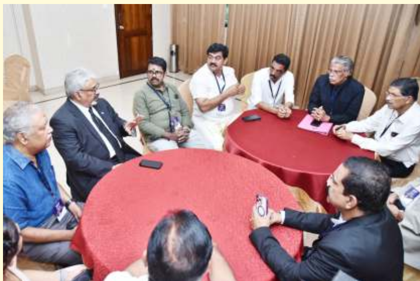
International President with Regional and District Leaders.