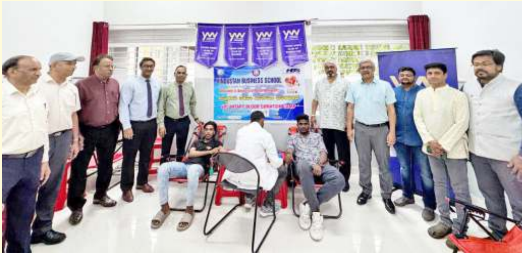
Blood Donation Camp at Hindustan Academy organised by Bangalore District. Total number of units donated - 88.