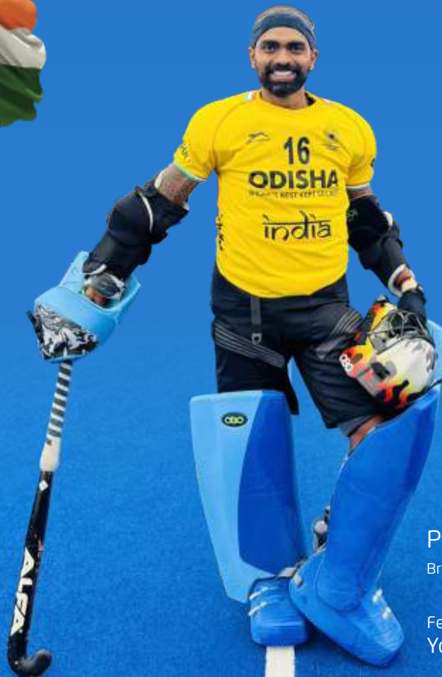
Parattu Raveendran Sreejesh Bronze Medalist, Paris Olympics 2024

Felicitated by Young Minds Club of Kizhakkambalam