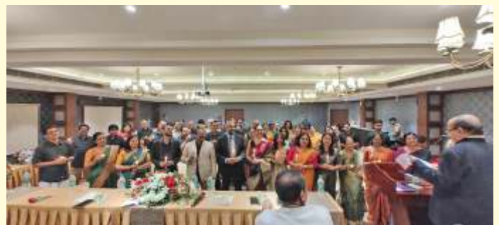
Installation of Young Minds Club of KIZHAKKAMBALAM Region-II