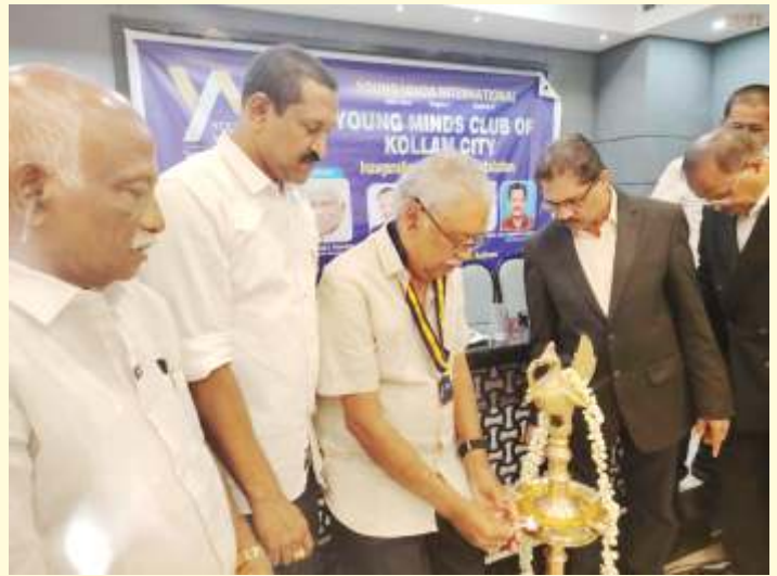
Installation of Young Minds Club of Kollam City