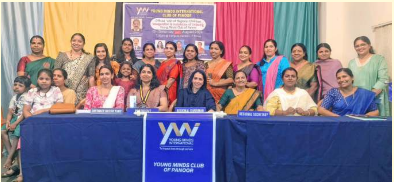
The Ladies Wing of Young Minds Club of Panor