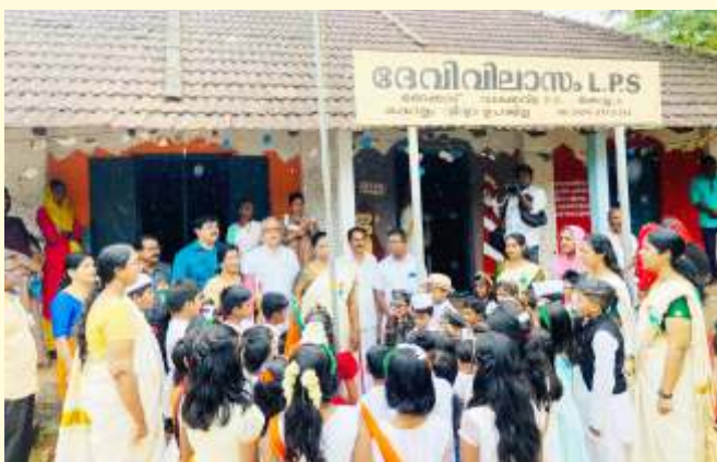
Young Minds International, Region-I, Independence Day Celebration at Devi Vilasam LPS, Manacaud, Kollam