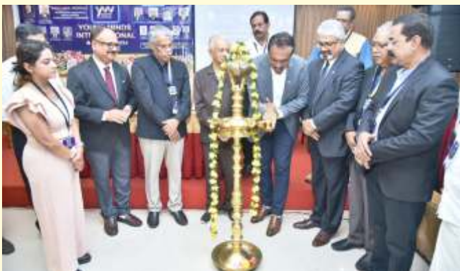
Inauguration of the programme