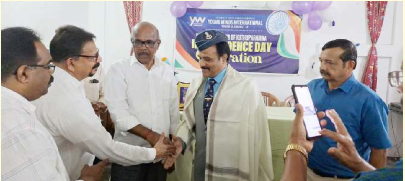
YMI Kuthuparamba honored Group Capt. Rakesh Nair, on the occasion of Independence Day Celebration