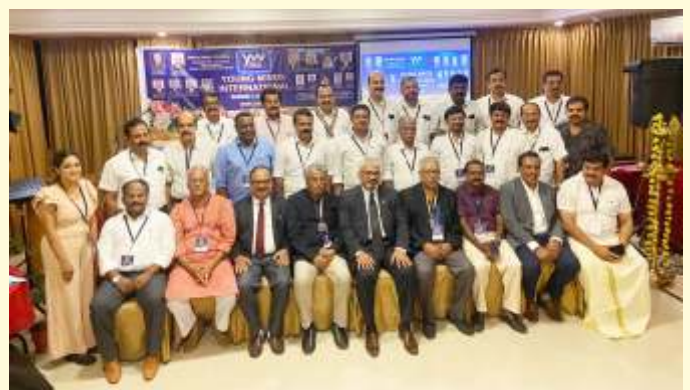
Young Minds Club of TRIVANDRUM CENTRAL