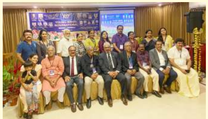
Young Minds Club of TRIVANDRUM HILL VIEW