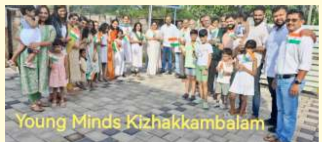
Young Minds Kizhakkambalam