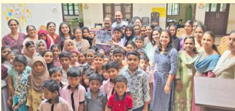
Young Minds Club of Kizhakkambalam School Project