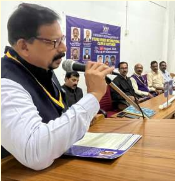
Installation of Young Minds Club of Mattanur