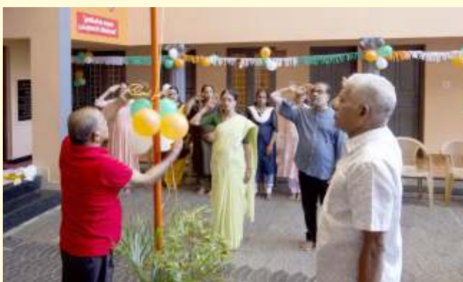
Independence Day celebrations at Tripunithura, Ernakulam.