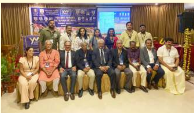
Young Minds Club of TRIVANDRUM LUCKY CHARMS