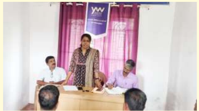
Celebrations of YMI Club of Taliparamba, District-II of Region-II