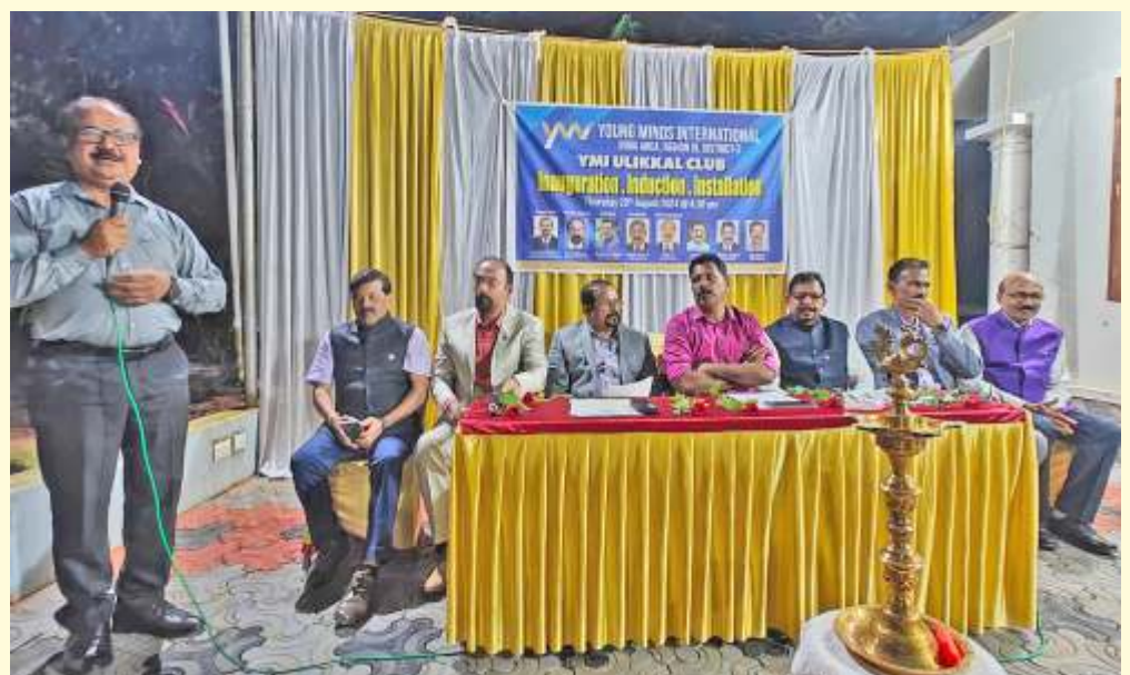
Installation of Young Minds Club of Ulikkal Region-III