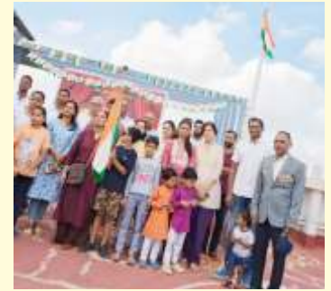
Flag hoisting by DG, Bangalore District