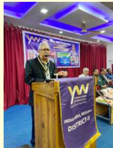
International President inaugurating various clubs