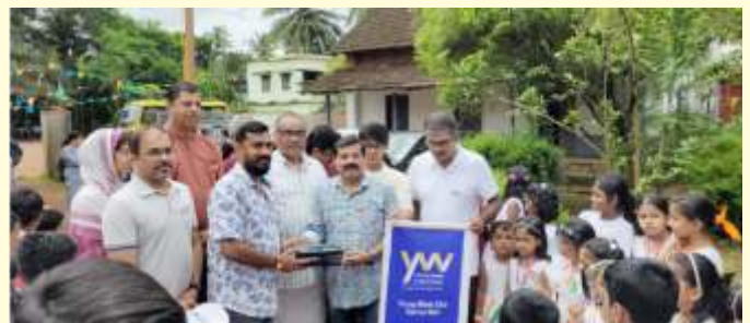
On the occasion of India's Independence Day, the Young Minds Club of Kannur Main participated in a flag-hoisting ceremony at the Radhavilasam UP School at Pallikunnu, Kannur. The club members distributed sweets to the children in attendance and also donated a microphone to the school, as requested by the school authorities.