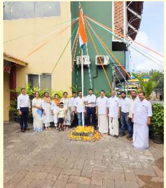
Flag Hoisting by YMI Smart City, Kakkanad