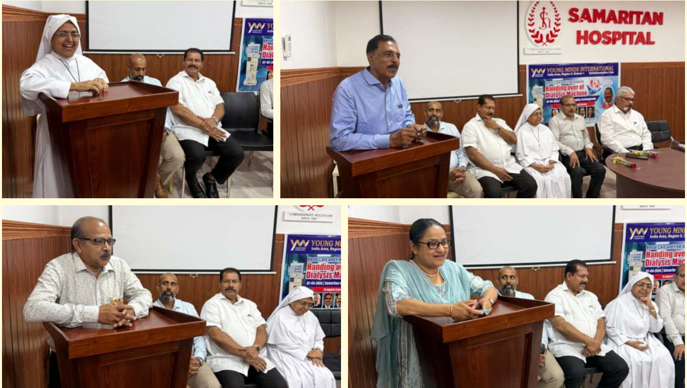
Handing over of Dialysis Machine to Samaritan Hospital by Young Minds Club of Kizhakkambalam