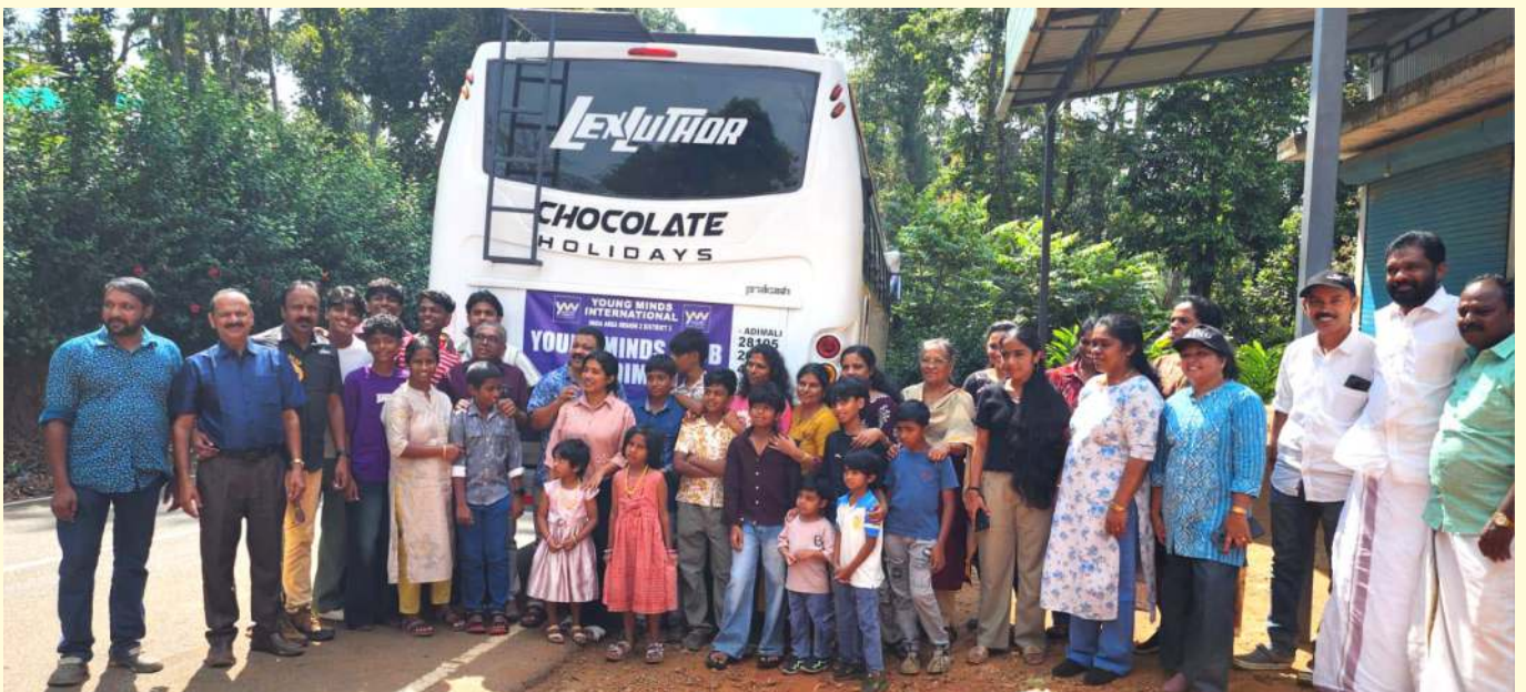
Young Minds Club of Adimali - Family Tour