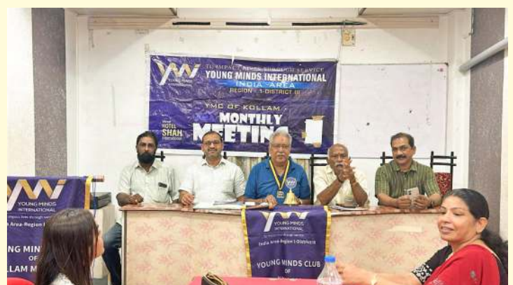
Second Anniversary of Young Minds International, celebrated by Young Minds Club of Kollam, Region-I