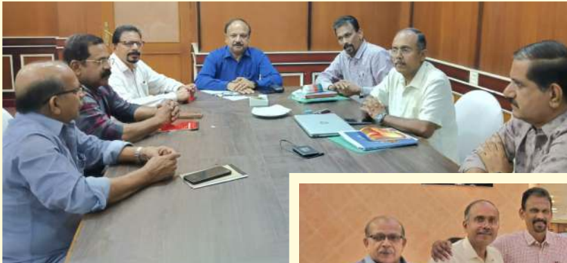
Meeting of Area team with the Regional Chairs of 2025-26