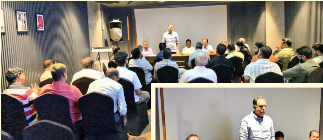
Area Convention 2026 Committee meeting