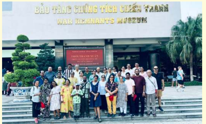
Region-I - Vietnam Tour