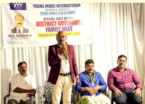
Official visit of the District Governor and family meet - Young Minds Club of Edoor