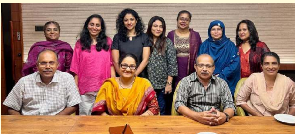
Orientation Meeting Young Minds Club of Crown Kochi, at Recca Club, Kakkanad