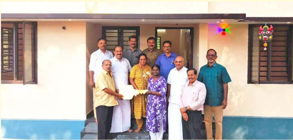
Key handing ceremony of a house sponsored by Young Minds Club of Mulanthuruthy Region2 District-II