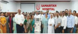
പുഴത്തോടു ചേർന്നു സമാരിതൻ ആശുപത്രിയുടെ ഉദ്ഘാടനം. ഇടതു മുതൽ വലതുവരെ: സമാരിതൻ ആശുപത്രിയുടെ ഉദ്ഘാടനത്തിൽ പങ്കെടുത്തവർ.