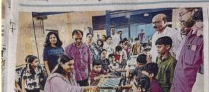
പുഴ മാസ് ഹാജർകളുടെ അദ്ധ്യക്ഷതയിൽ പുഴ മാസ് യൂണിറ്റിന്റെ ഉദ്ഘാടനം.

പുഴത്തോടു ചേർന്നു സമാരിതൻ ആശുപത്രിയുടെ ഉദ്ഘാടനം. ഇടതു മുതൽ വലതുവരെ: സമാരിതൻ ആശുപത്രിയുടെ ഉദ്ഘാടനത്തിൽ പങ്കെടുത്തവർ.