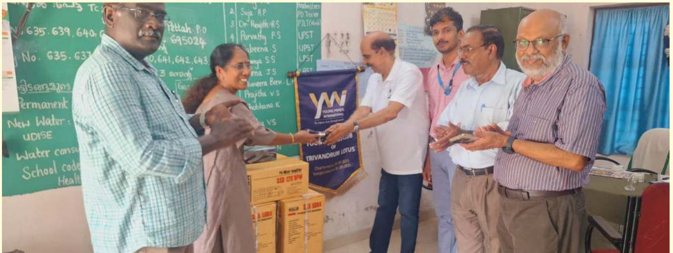
Handing over Public Address System to Govt UP School, Chakkai, Trivandrum by Young Minds Club of Trivandrum Lotus