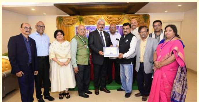
Presentation of the Charter Certificate of Young Minds Club of Secunderabad