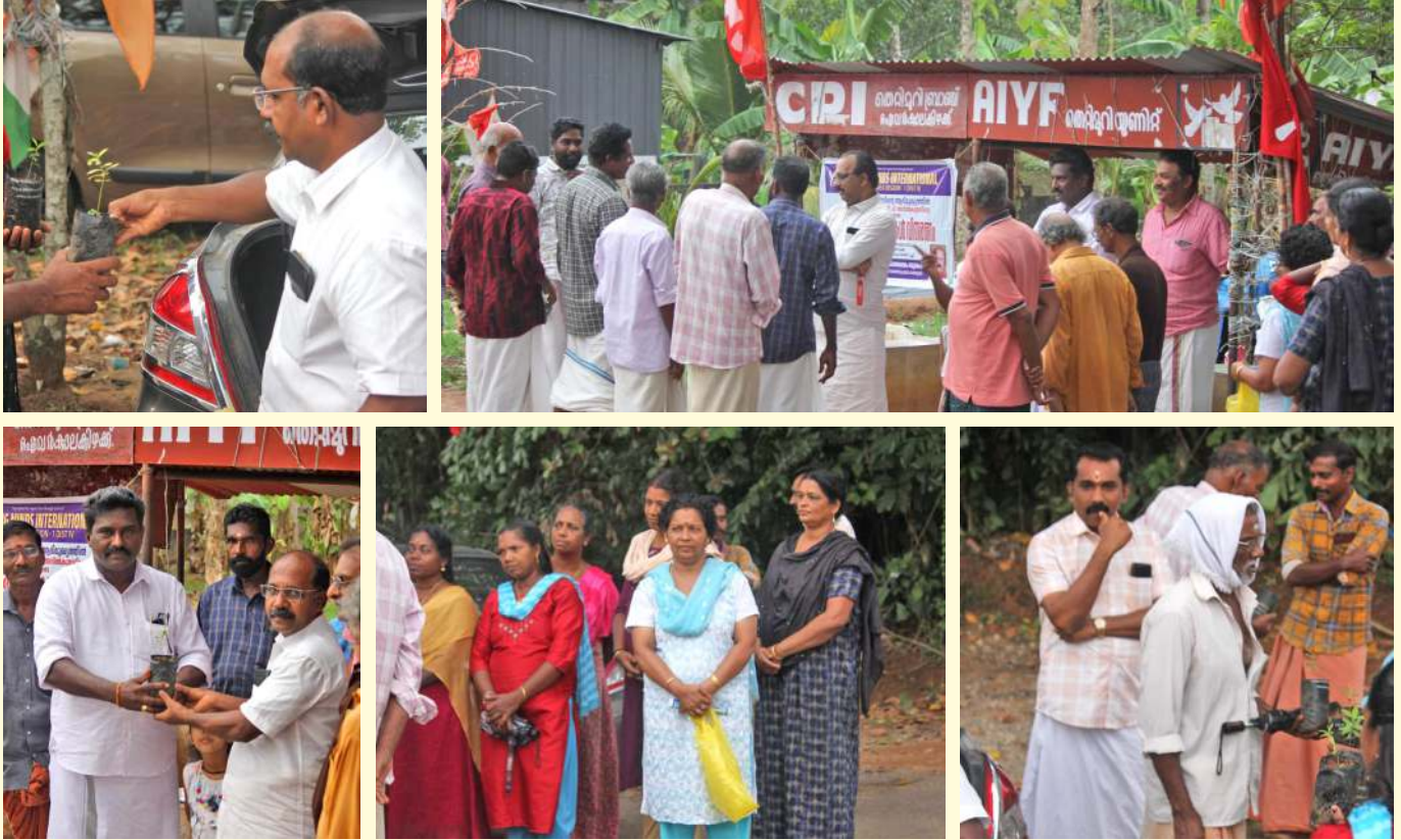
Sandalwood sapling distribution by Young Minds Club of 7th Mile