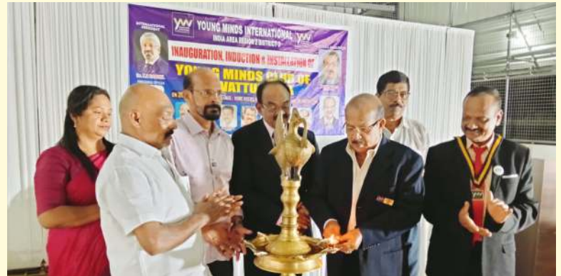
Inauguration of Young Minds Club of Muvattupuzha Region-II, District-III