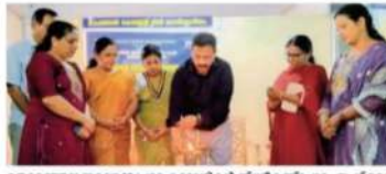
ശ്രീകണ്ഠപുരം നഗരസഭയുടെ പരിധിയിൽ വസിക്കുന്ന ബി.പി.എൽ വിഭാഗത്തിലെ തൊഴിലാളികൾക്ക് ശ്രീകണ്ഠപുരം യൗവ്വ മെൻഡിംഗ് ക്ലബിന്റെ ആഭിമുഖ്യത്തിൽ ബുഡ് ഷുഗർ മോണിറ്ററിംഗ് മെഷീൻ നൽകുന്ന ചടങ്ങിൽ പങ്കെടുത്തവർ.