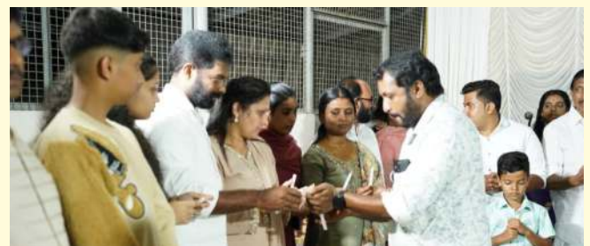
Young Minds Club of Adimali - Family Meeting and Induction of new members