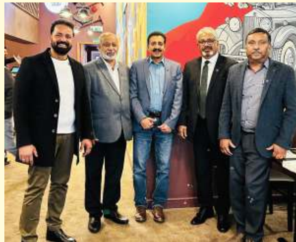
International President with leaders of Nottingham and Cheltenham clubs