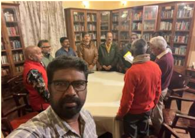
Young Minds Club of Coonoor installation meeting