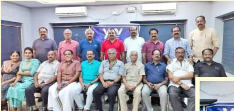
District Presidium Meeting of District-I, Region-I on 21-11-2024