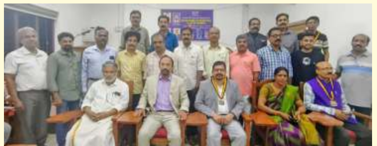
Young Minds Club of Champad