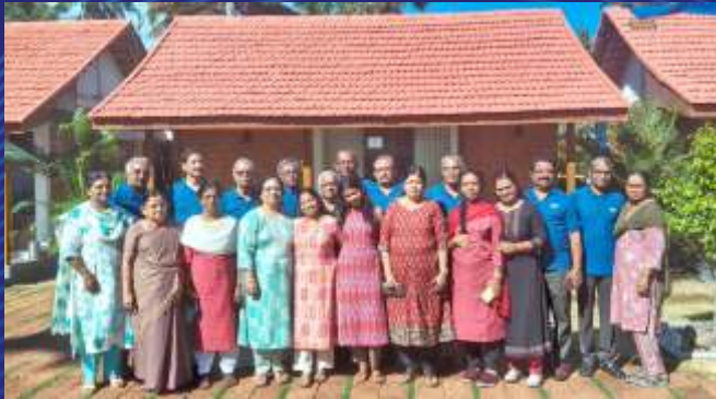
YMI Trivandrum Tower on holiday at Varkala.