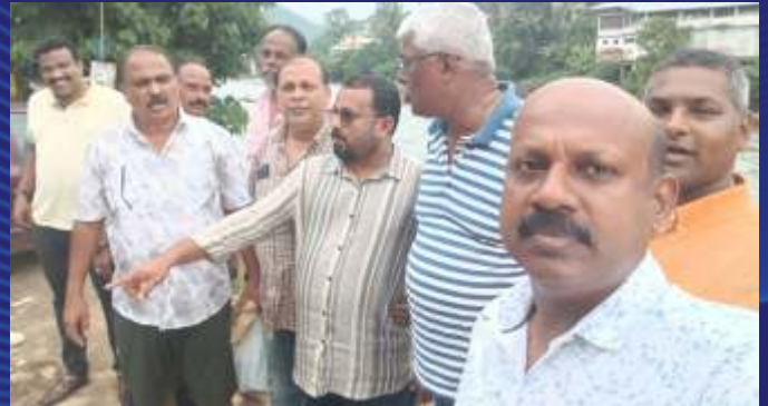
Young Minds Club of Pathanapuram tour to Vagamon