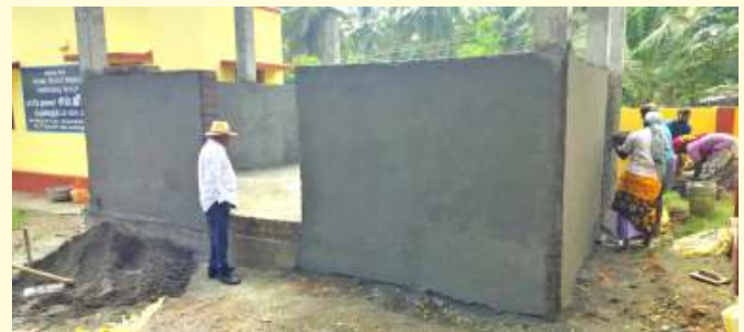
Construction of Classroom.