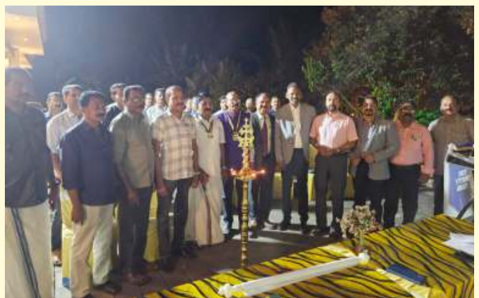
Inauguration of Young Minds International Vallithode Club sponsored by Iritty Young Minds Club