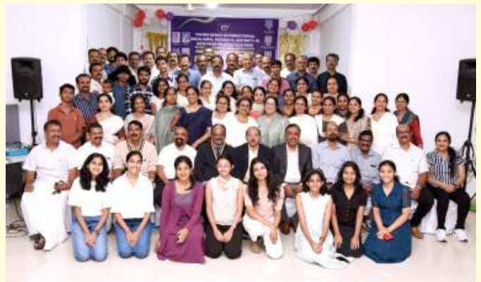
Inauguration of Green Valley Muttom Club and New Year celebration