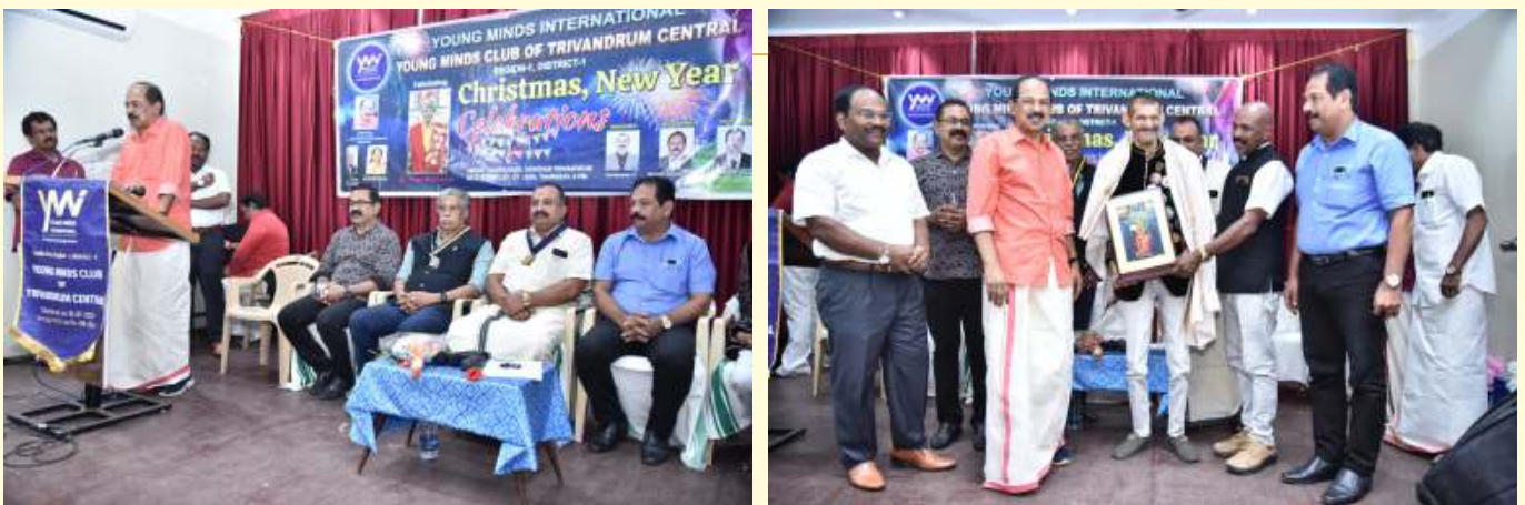
YMI Trivandrum Central - Christmas and New year Celebration