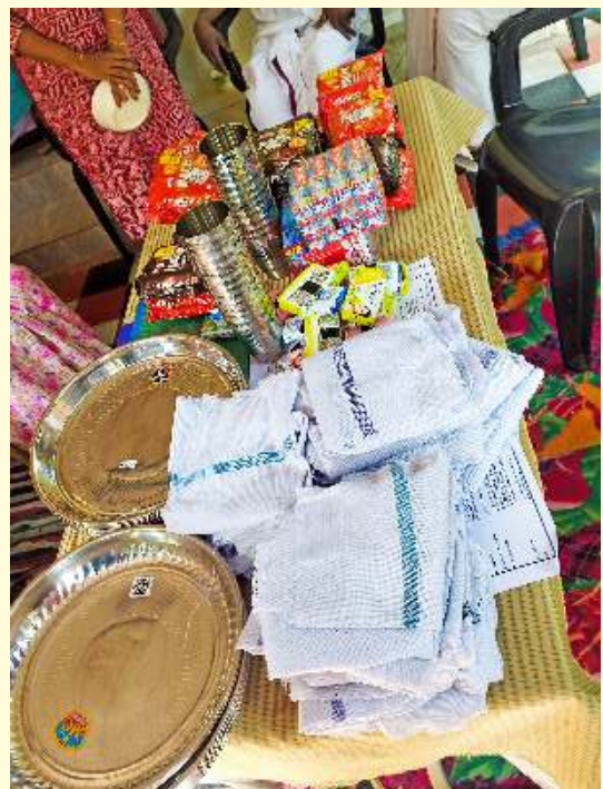
Stainless steel plates and glasses to provide meals for the special needs children at the school and personal care products contributed by Young Minds Club Pathanamthitta.