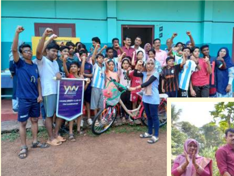
Distribution of Sports Kit & Bicycle to Children of Karunya Nikethan School for the Hearing Impaired by YMI Trichambaram club