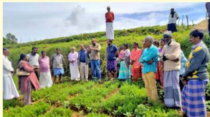
Meeting with farmers