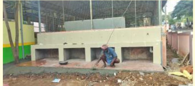
Construction of Washing Unit