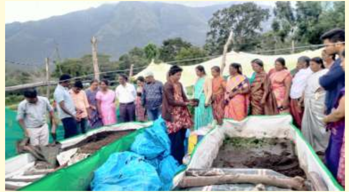
Women farmers given exposure to learn vermi-compost making