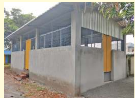
Construction of Dining Centre for students