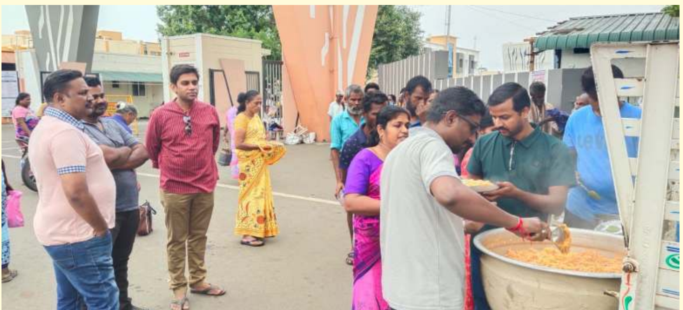
We distributed over 250 meals at TIRUPUR GH AKSHAYAM PROJECT FOOD FOR NEEDY; running successfully for 249th week.