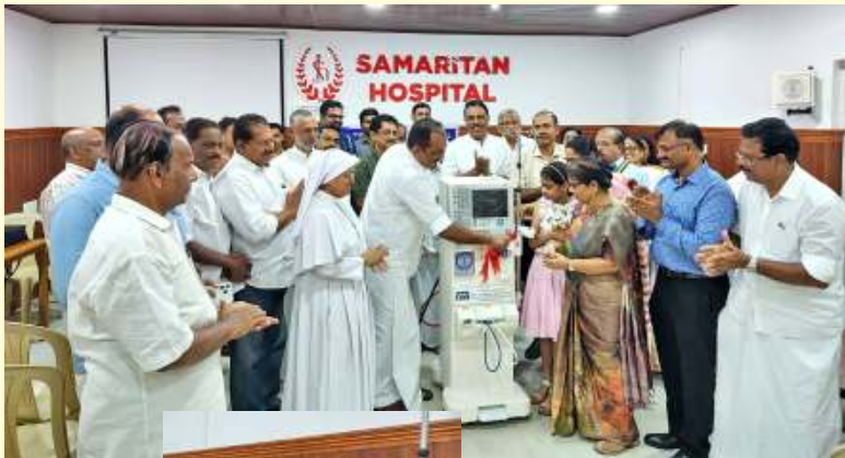
Handing over of Dialysis Machine to Samaritan Hospital, Pazhangand by YMI Kizhakkambalam Club