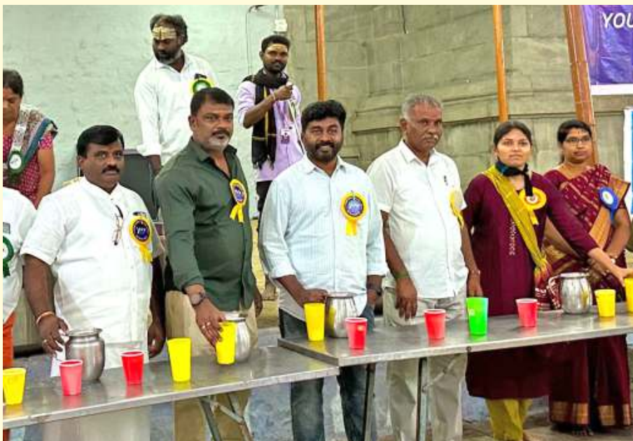
YMI of Gobi Galaxy spread joy and refreshment by distributing buttermilk to 10,000 devotees at the Pariyur Amman Temple festival.