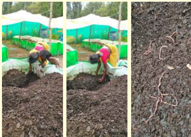
Tribals are taught and encouraged to produce vermi-compost to earn additional income