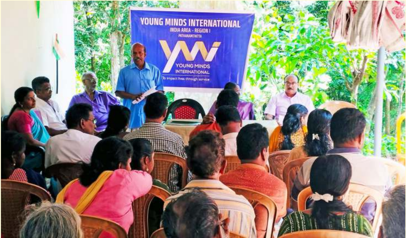
Public meeting organized by Young Minds Pathanamthitta at Peace Valley School located in a rural village.