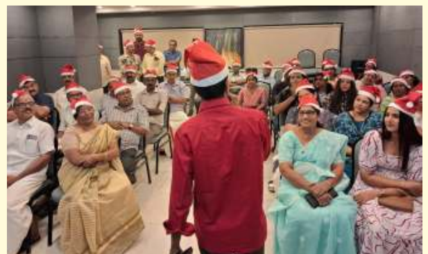
Christmas and New year celebration - YMI Kollam