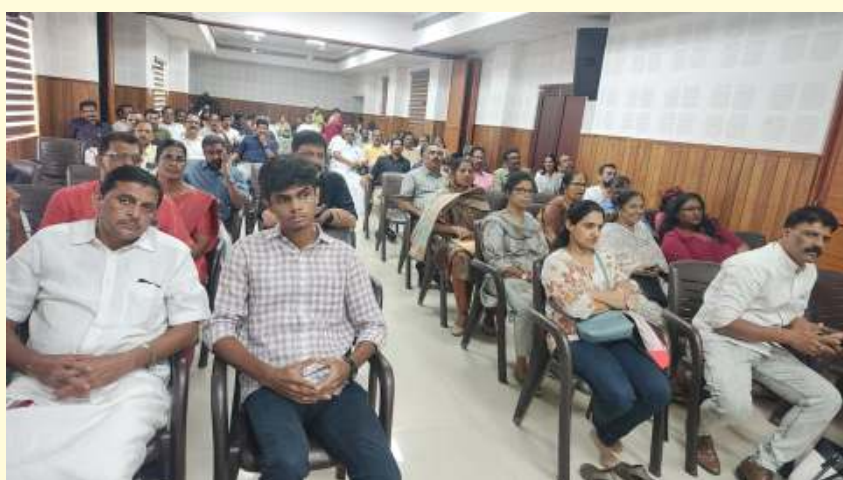
Regional Cultural Meet, District-III