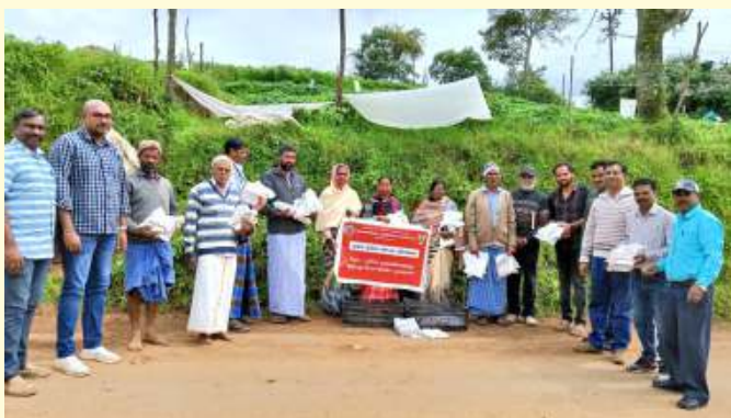
Farmers are given samples of natural compost