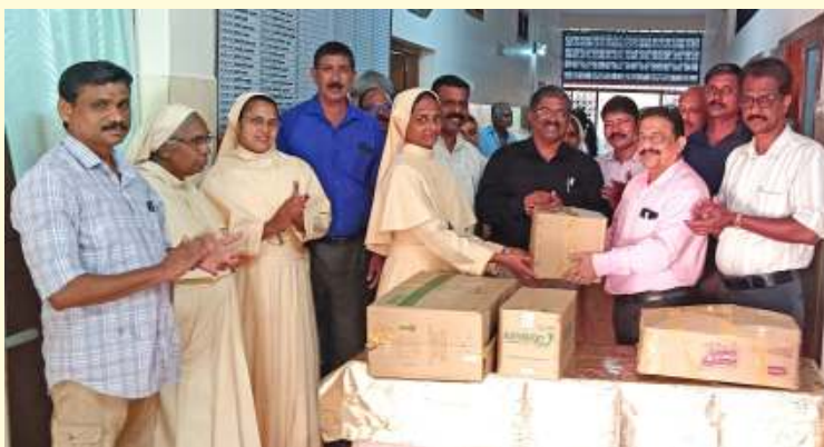
Alakode Young Minds Club workers along with District Team celebrate Christmas and New Year by providing medicines and other essentials to the honorable inmates of Tabore Old Age Home.