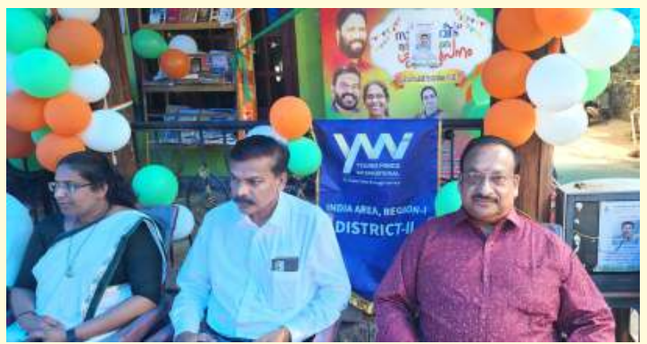
76th Republic Day celebration at VALSALYAM Charity home, Varkala in association with YMI Dist-II, in the presence of Deputy Collector, Municipal Chairman, Dist. Panchayat President, Councillors and other dignitaries.