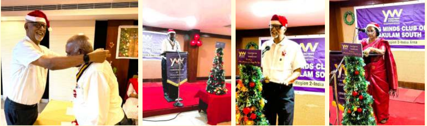
YMI Ernakulam South - Christmas celebration