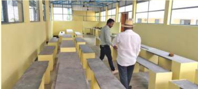
Construction of Dining Hall in a school