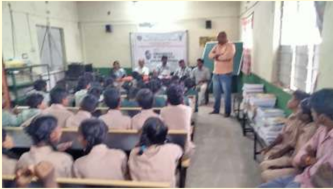
Education to Tribal children at Govt. Tribal school