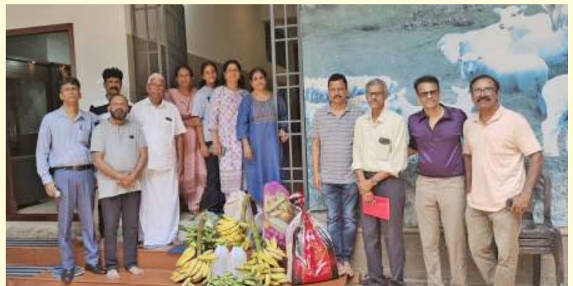
YMI Taliparamba City Club providing vegetables and provisions