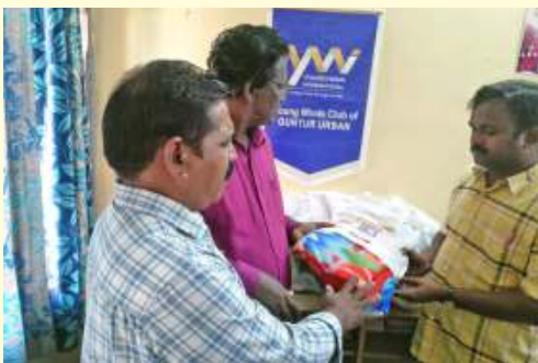
YMI Guntur Urban started off with charity and educational programmes