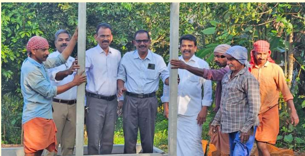
Home for Homeless, YMI Edoor club