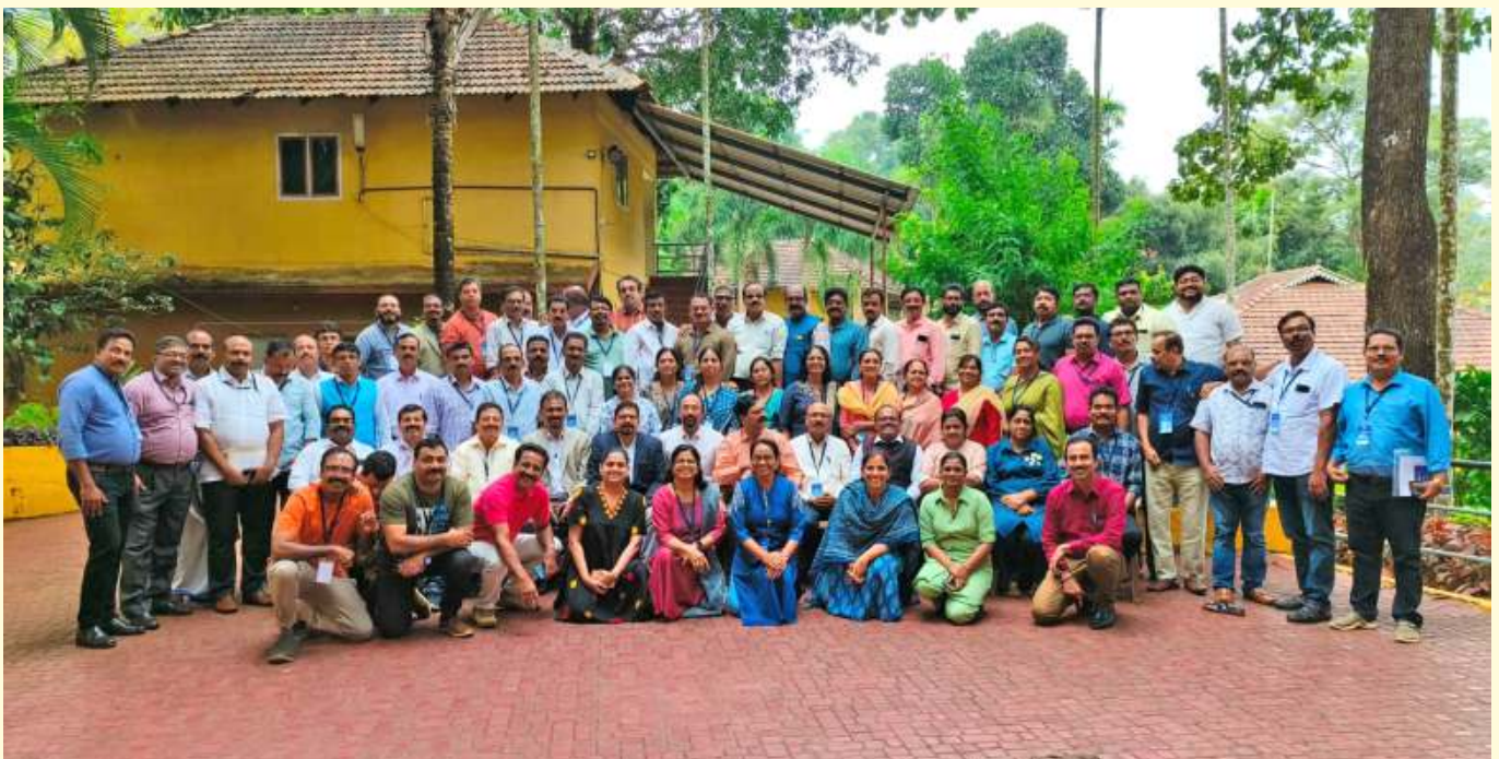
Participants in the Region III PST Priming & Leadership Summit at Wayanad