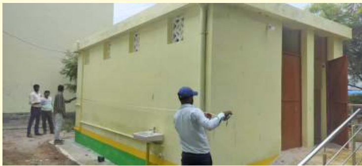
Construction of Community Toilet.