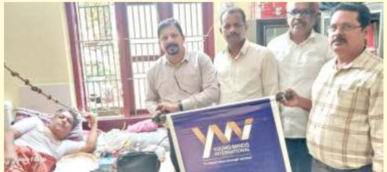
Young Minds Club of Kuthuparamba honouring elderly and visiting the sick

Over 250 more meals were provided at TIRUPUR GH AKSHAYAM PROJECT FOOD FOR NEEDY. This is the 233rd week of the project.