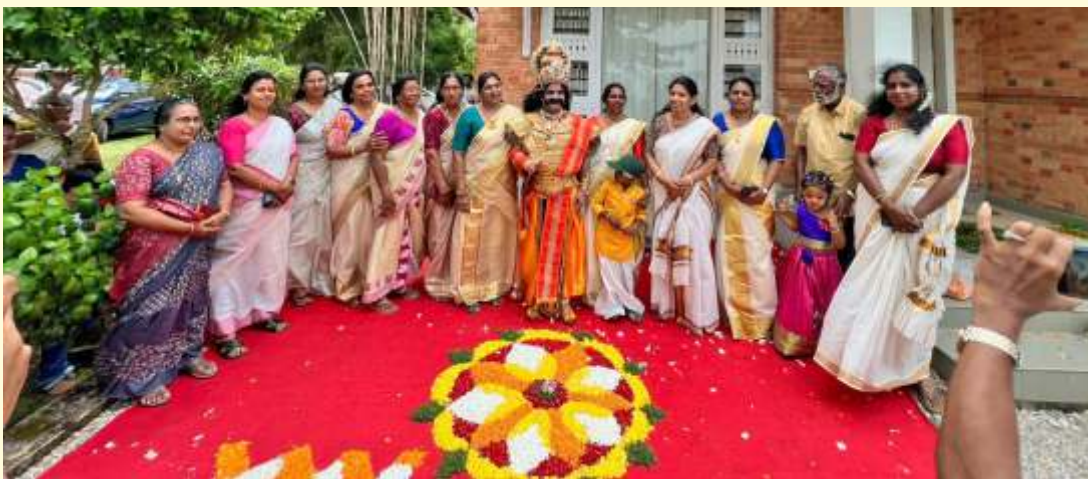
Kuthuparamba Onam and DG visit