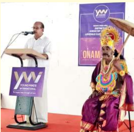
Onam celebration of District-III of Region-II, at Tripunithura