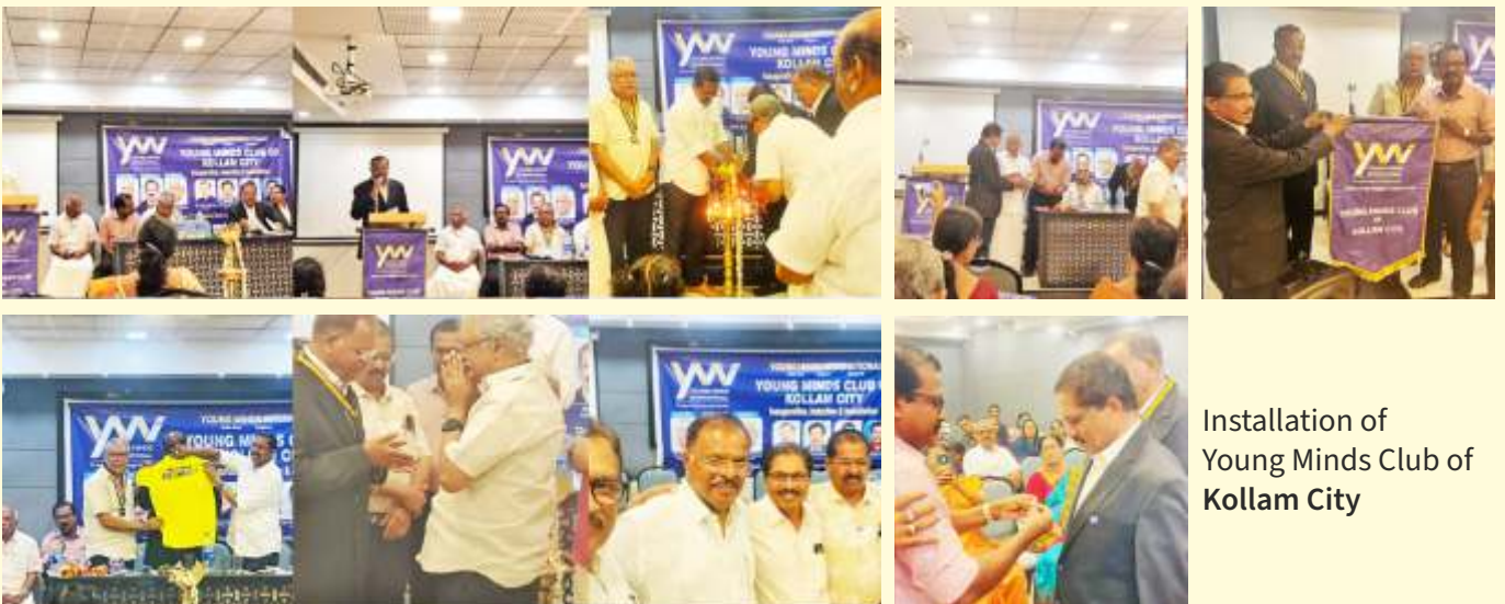
Installation of Young Minds Club of Kollam City