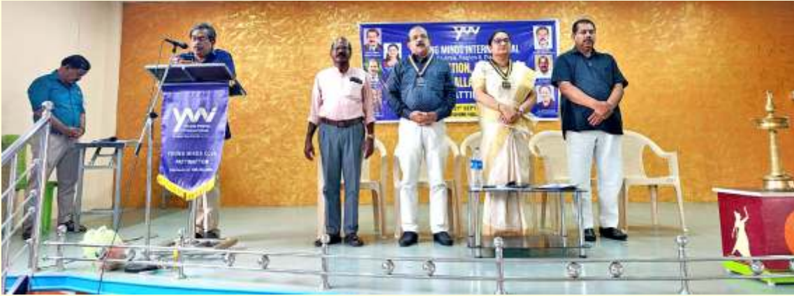
Young Minds International Region-II District-I Young Minds Club of Pattimattam Club inauguration in progress.