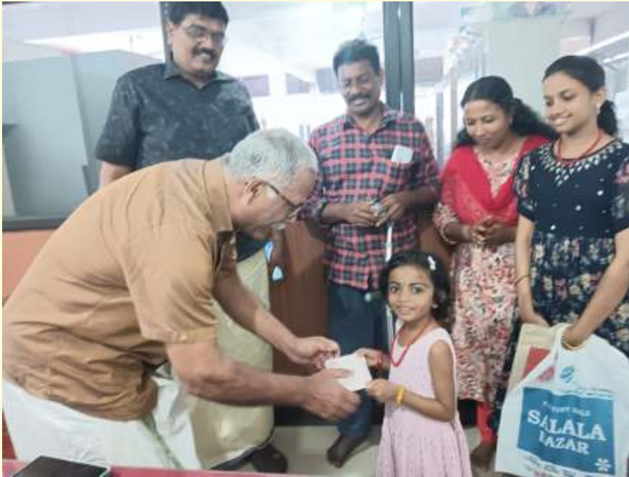
Young Minds Club of Pathanapuram - LIFE SUPPORT AID to a lottery agent