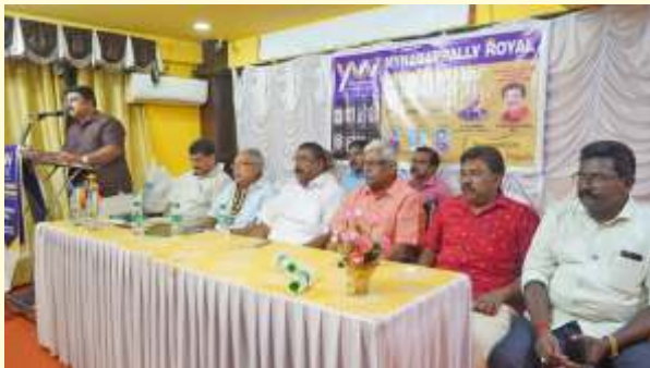
Installation of Young Minds Club of Mynagapally Royal