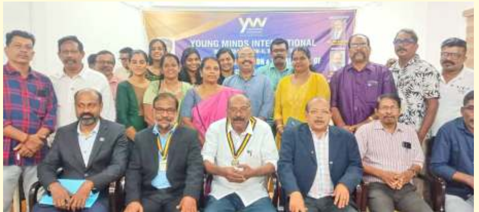
Installation of Young Minds Club of Edacochin Royals, Region-II