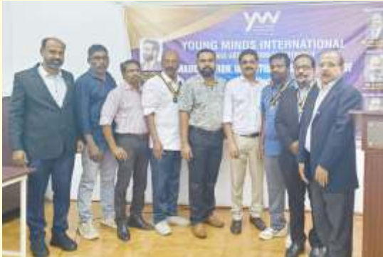
Office bearers of Young Minds International Greater Cochin and Edacochin Royals