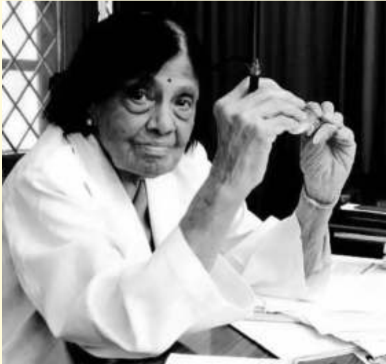
Dr. Sivaramakrishna Iyer Padmavathi

In the year 1917, a Tamil Indian girl was born into a middle-class family in Rangoon, Burma (now Myanmar), where her father had relocated for work. He named her Sivaramakrishna Iyer Padmavathi. At a time when women were traditionally confined to the kitchen/illiterate, the middle-class girl earned her MBBS from Rangoon Medical College.