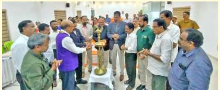
Installation of Young Minds Club of Peravoor