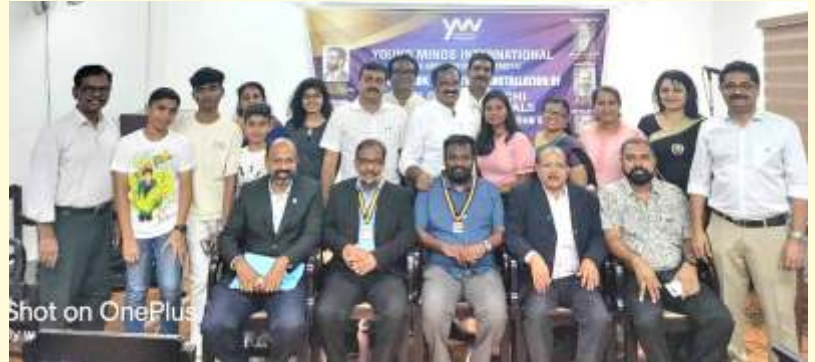
Installation of Young Minds Club of Greater Cochin, Region-II