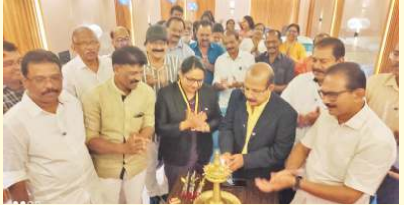
Installation of Young Minds Club of Thrikkakara