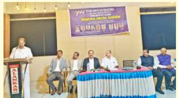
Installation of Young Minds Club of Iritty