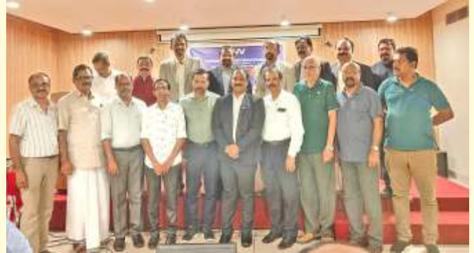
Installation of Young Minds Club of Cannanore North