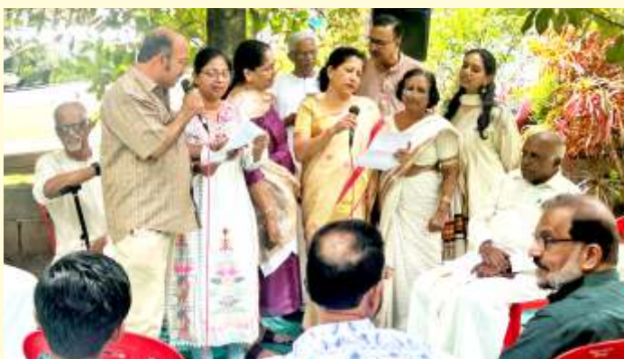
Onam celebration of Young Minds Club of Ernakulam South, Region-II