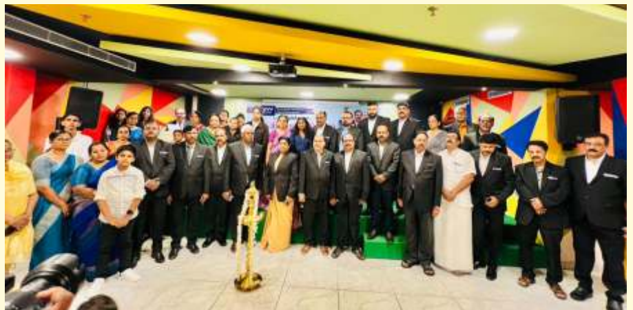
Installation of Young Minds Club of Pathanapuram, Region-I, District-IV