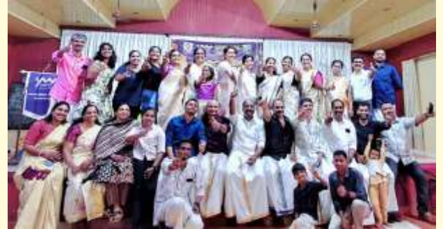
Taliparamba Onam celebration and Regional Chairman visit