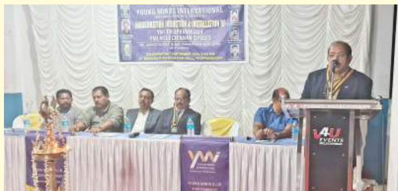
Installation of Young Minds Club of Thopramkudy and Melechinnar, Region-II