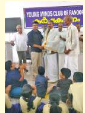
Young Minds Club of Panoor