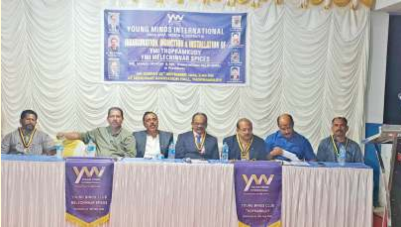
Installation of Young Minds Club of Thopramkudy and Melechinnar Spices