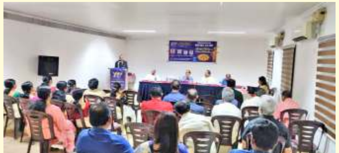
Young Minds Club of Trivandrum Royal Club Family meeting & Onam Celebration