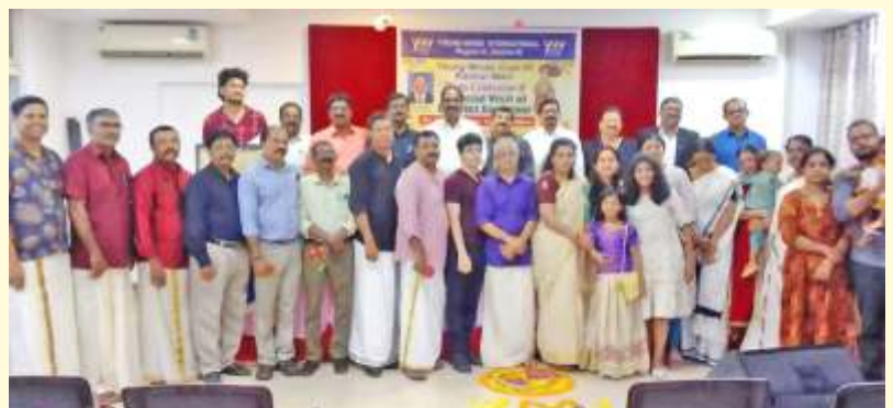
Young Minds Club of Kannur Main DG Visit & Onam Celebration