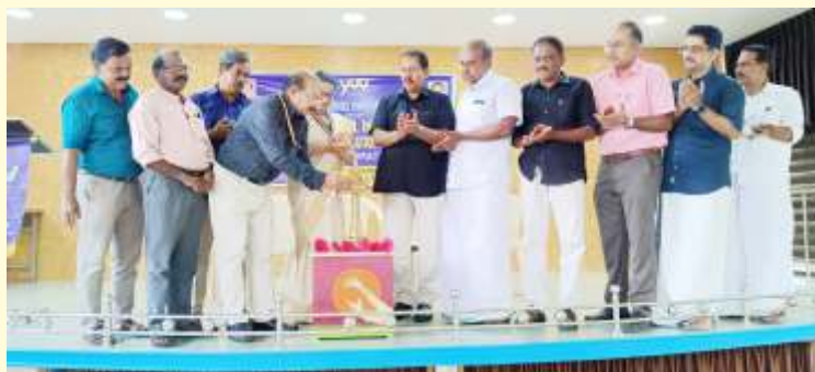
Installation of Young Minds Club of Pattimattom, District-I, Region-II