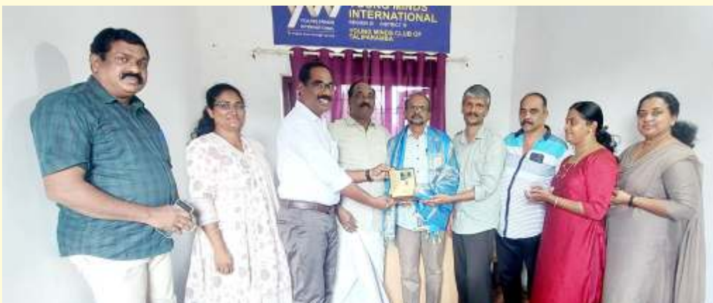
Young Minds Club of Taliparamba