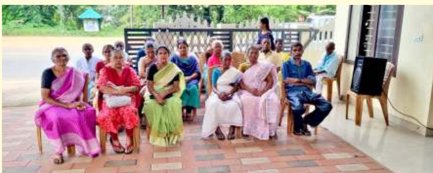
Eye Camp conducted by Young Minds Club of Pulluvazhy , Region-II in August 2024