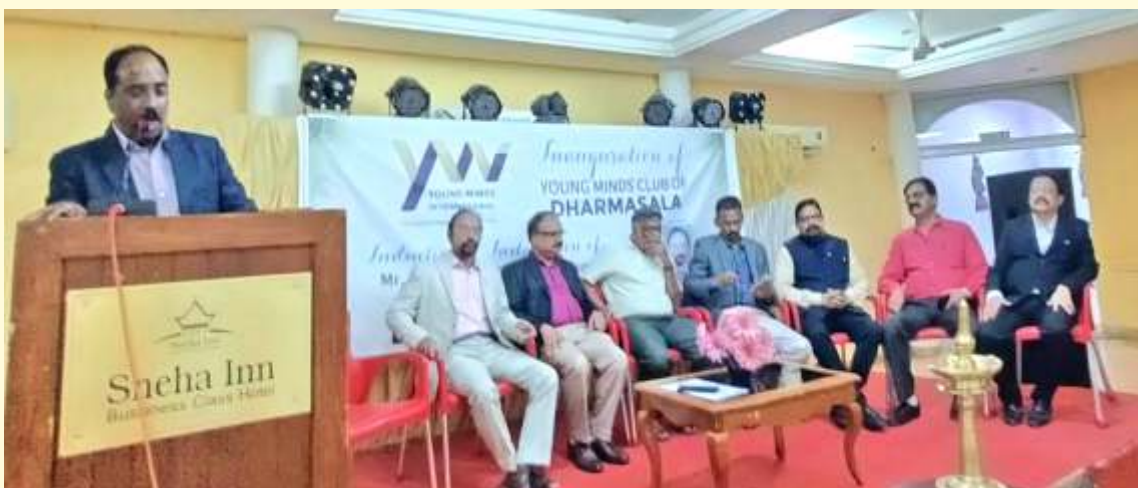
Installation of Young Minds Club of Dharmasala