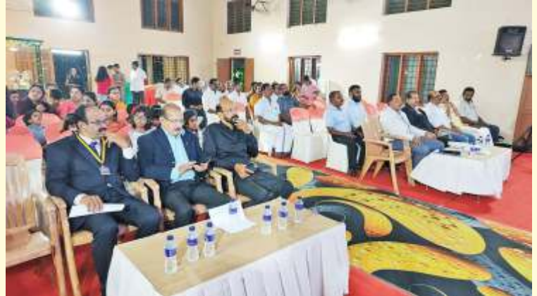
Installation of Young Minds Club of Pineapple Garden, Vazhakulam Region-II, District-III