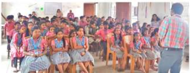
YOUNG MINDS CLUB OF PANOOR ലഹരിവിരുദ്ധ ബോധവൽകരണ ക്ലാസ് 8:04:2024 @ പാലക്കാട് യു.പി സ്കൂൾ