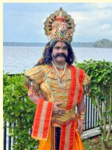
Onam celebration of Young Minds Club of Kollam