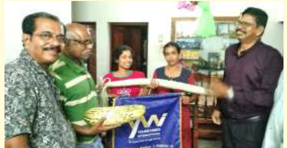
Young Minds Club of Attingal sharing homegrown vegetables with members and friends for Onam