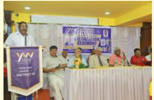
Installation of Young Minds Club of District Cabinet, Region-I, District-IV