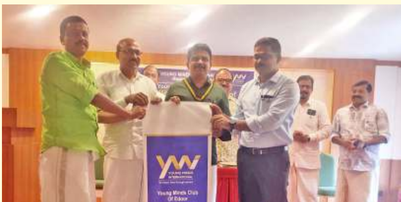
Installation of Young Minds Club of Edoor