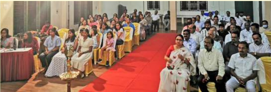
Installation of Young Minds Club of Kothamangalam, Region-II