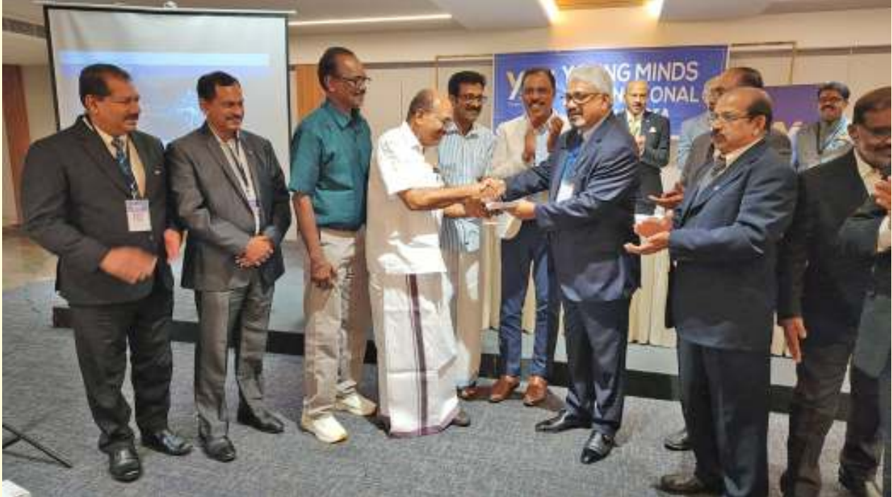
Mulanthuruthy Club contribution of ₹ 50,000 towards Wayanad project