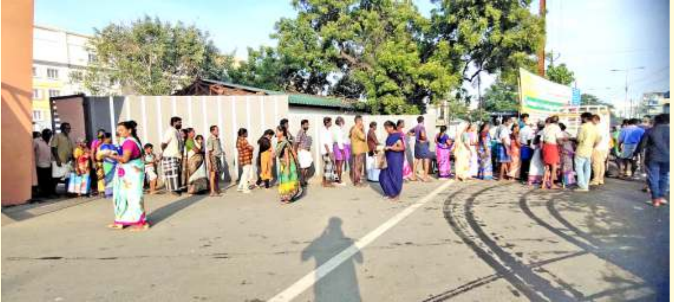
Over 250 more meals were provided at TIRUPUR GH AKSHAYAM PROJECT FOOD FOR NEEDY.