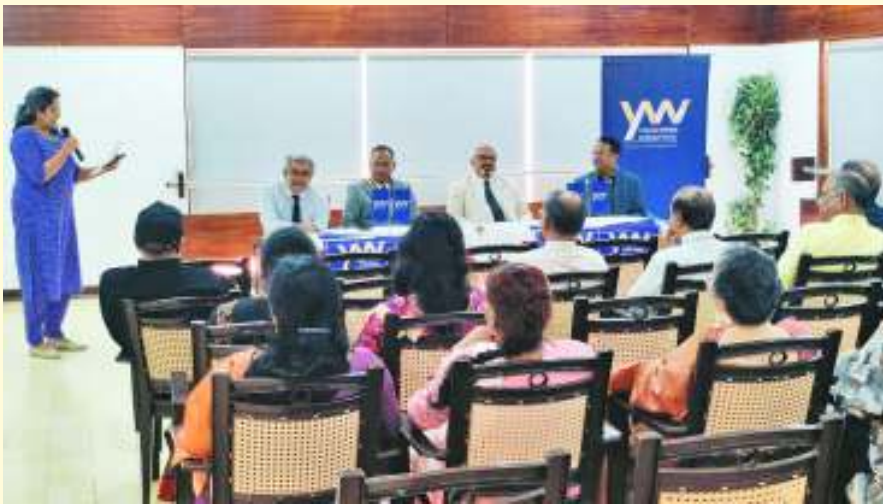
Young Minds International Bangalore District Council