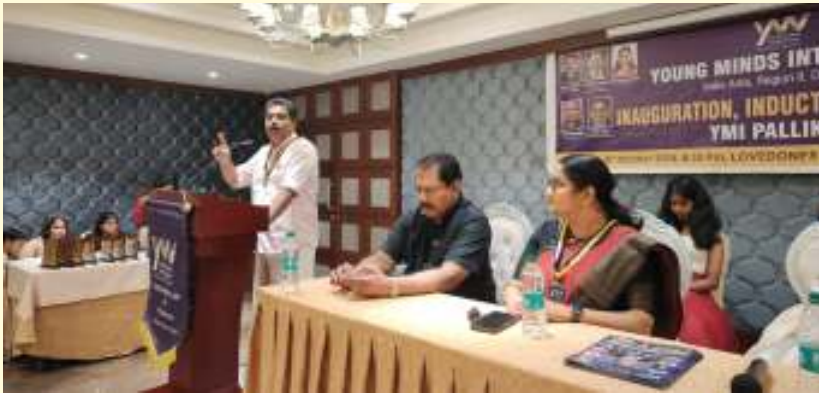
Installation of Young Minds Club of Pallikkara, Region-II, District-I