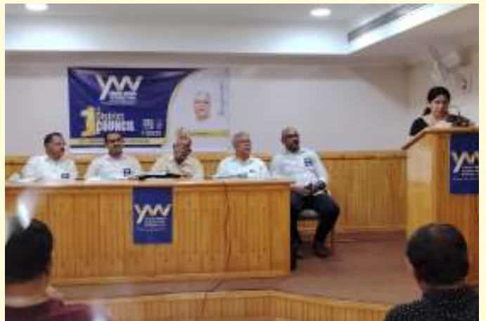
Region-I District-III 1st District Council meeting