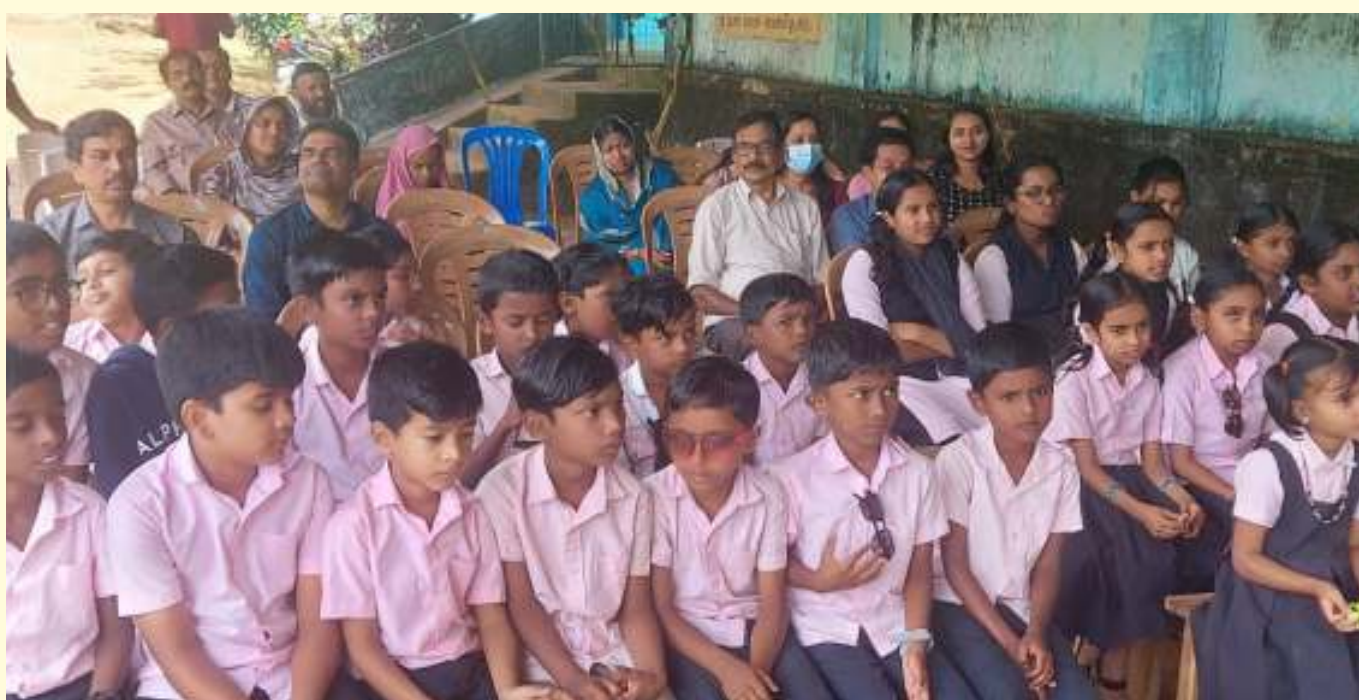
Erumakolli UP School, Meppadi Financial Aid & One Day Class, Young Minds Club of Panoor