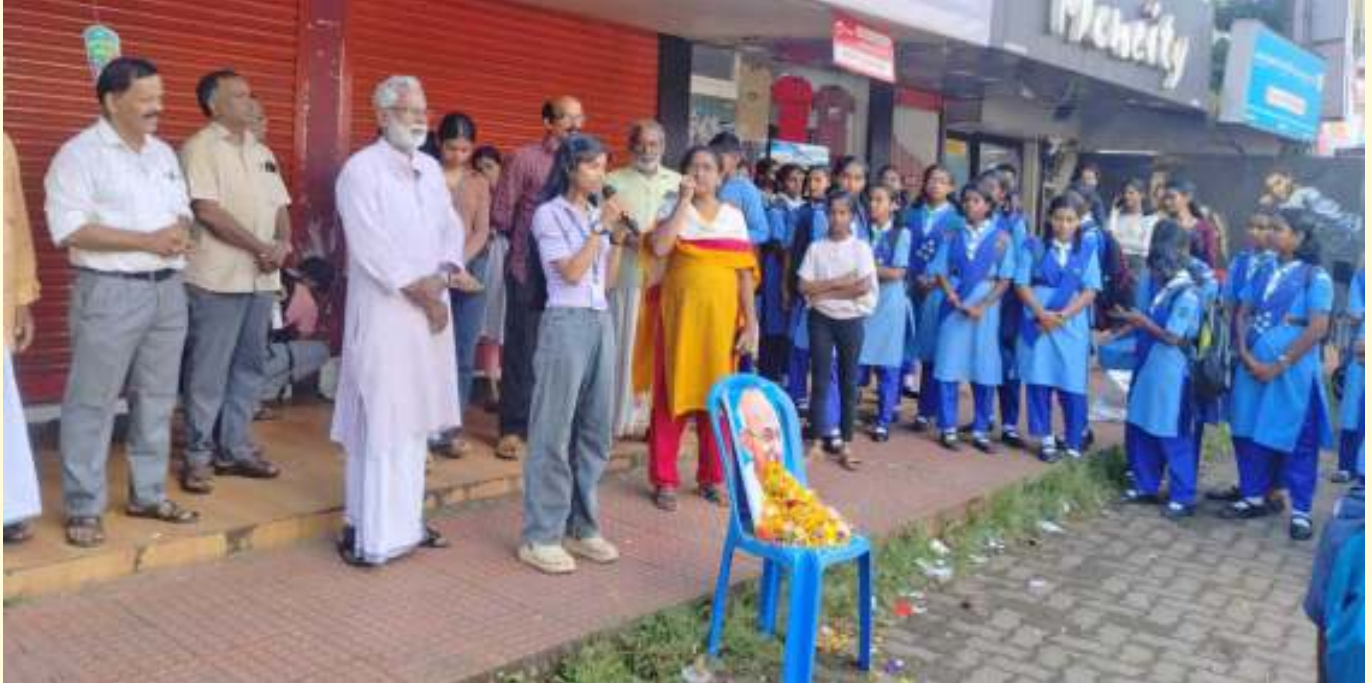
Young Minds Club of Pattimattom, Jayabharath Library and Kerala Navadarshana jointly organised Gandhi Jayanthi, anti-drugs padayatra and paid floral tributes at Gandhi Smriti. Scouts and Guides and children of Sree Narayana Engineering College participated in the programme.