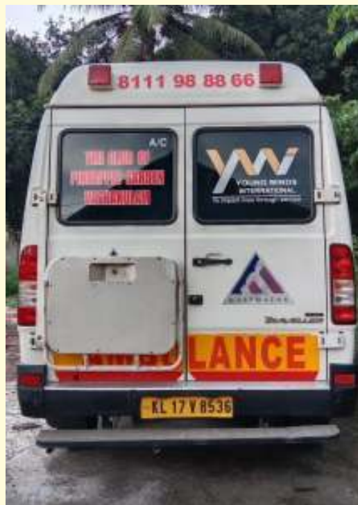
Ambulance service by YMI Vazhakulam Pineapple Garden club.