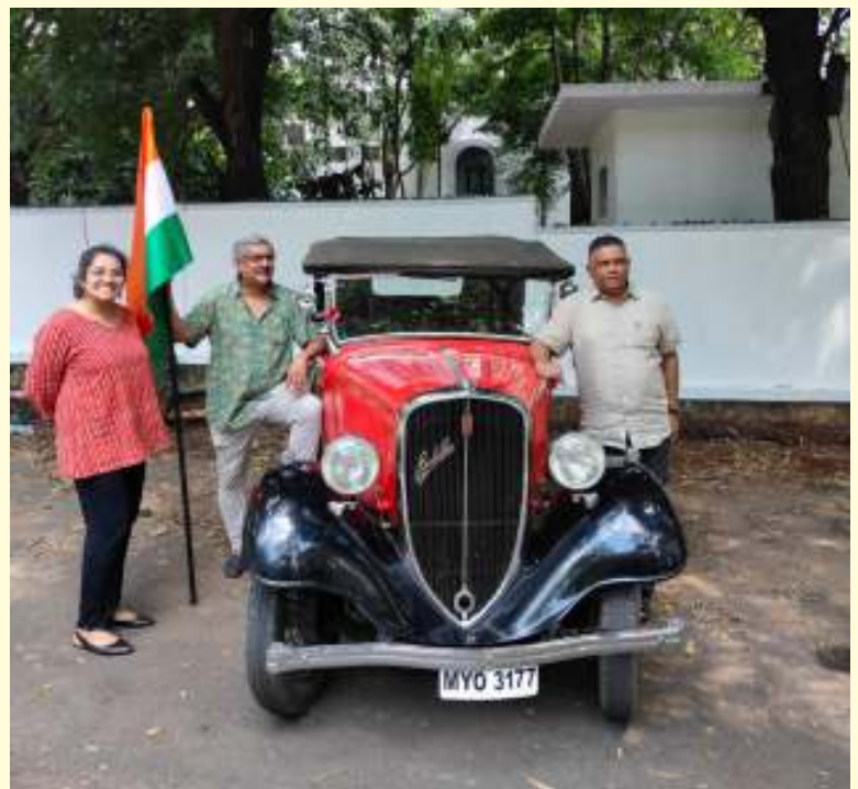
Young Minds Club of Bangalore celebrates Gandhi Jayanthi