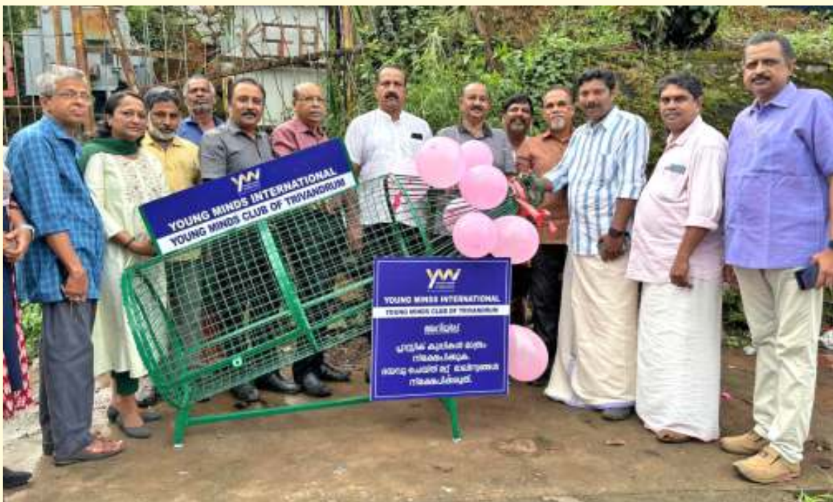
Young Minds Club of Trivandrum Sponsorship of Bottle Collection Project