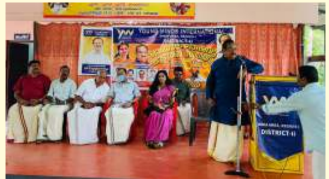
Onam celebrations District 2, Region 1