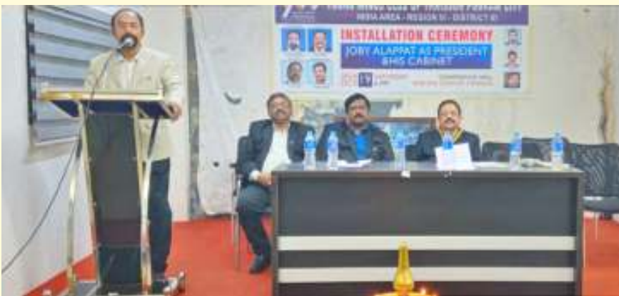
Installation of Young Minds Club of Thrissur Pooram City