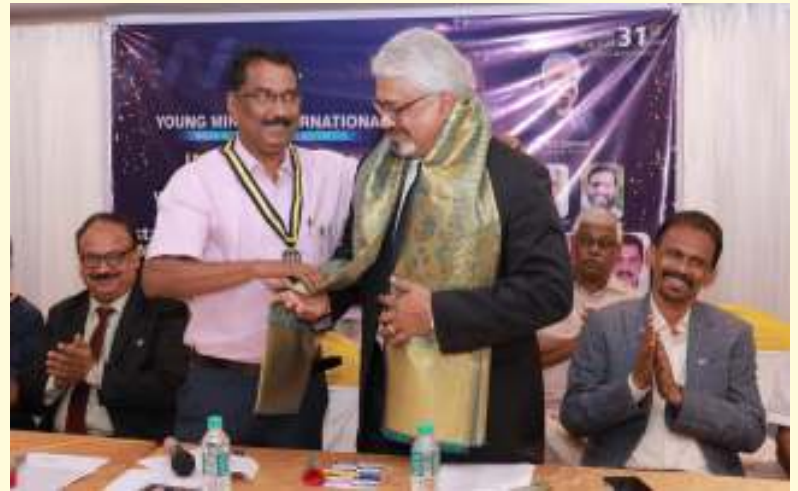
Installation of Young Minds Club of Adoor 1st YMI Club in Pathanamthitta District