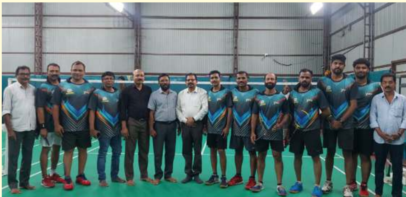
Badminton Tournament - Young Minds Club of Panoor