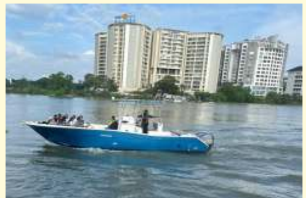
Boat Cruise conducted by Young Minds Club of Ernakulam South