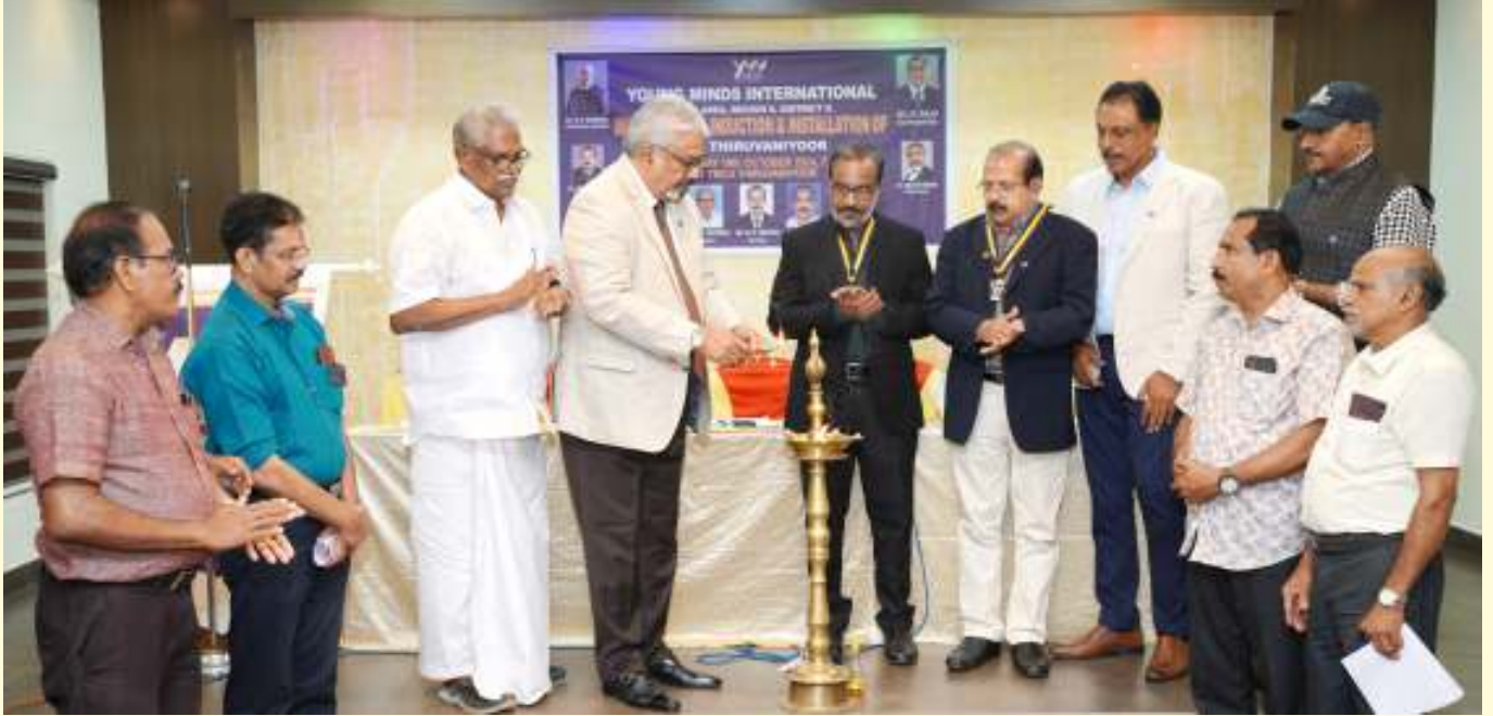
Installation of Young Minds Club of Thiruvaniyoor Club, Region-II