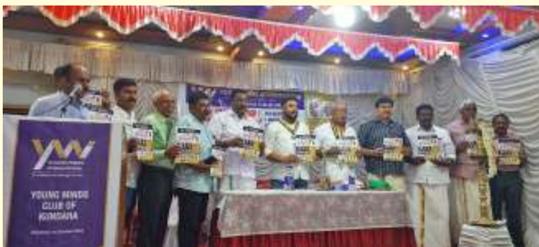
Installation of Young Minds Club of Kundara